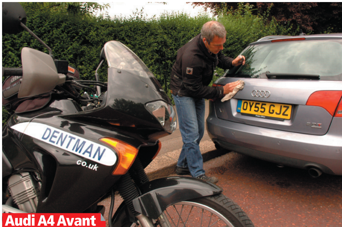
Audi A4 Avant