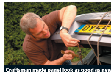
Craftsman made panel look as good as new